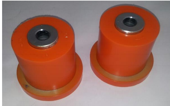
2x 1BH Polyurethane Pieces

The bush should be fitted on the wishbone such as the flange faces the rear of the car.